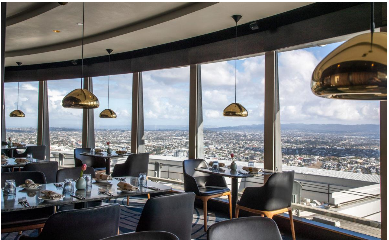
The Sugar Club

The key question then becomes how best to address this most important opportunity for wine producers? Who are the best distributors, which are the best paths to market, what are the most popular wines styles, which regions / countries / brands / suppliers are having the most success and how much money is there to be made from On-Premise sales?