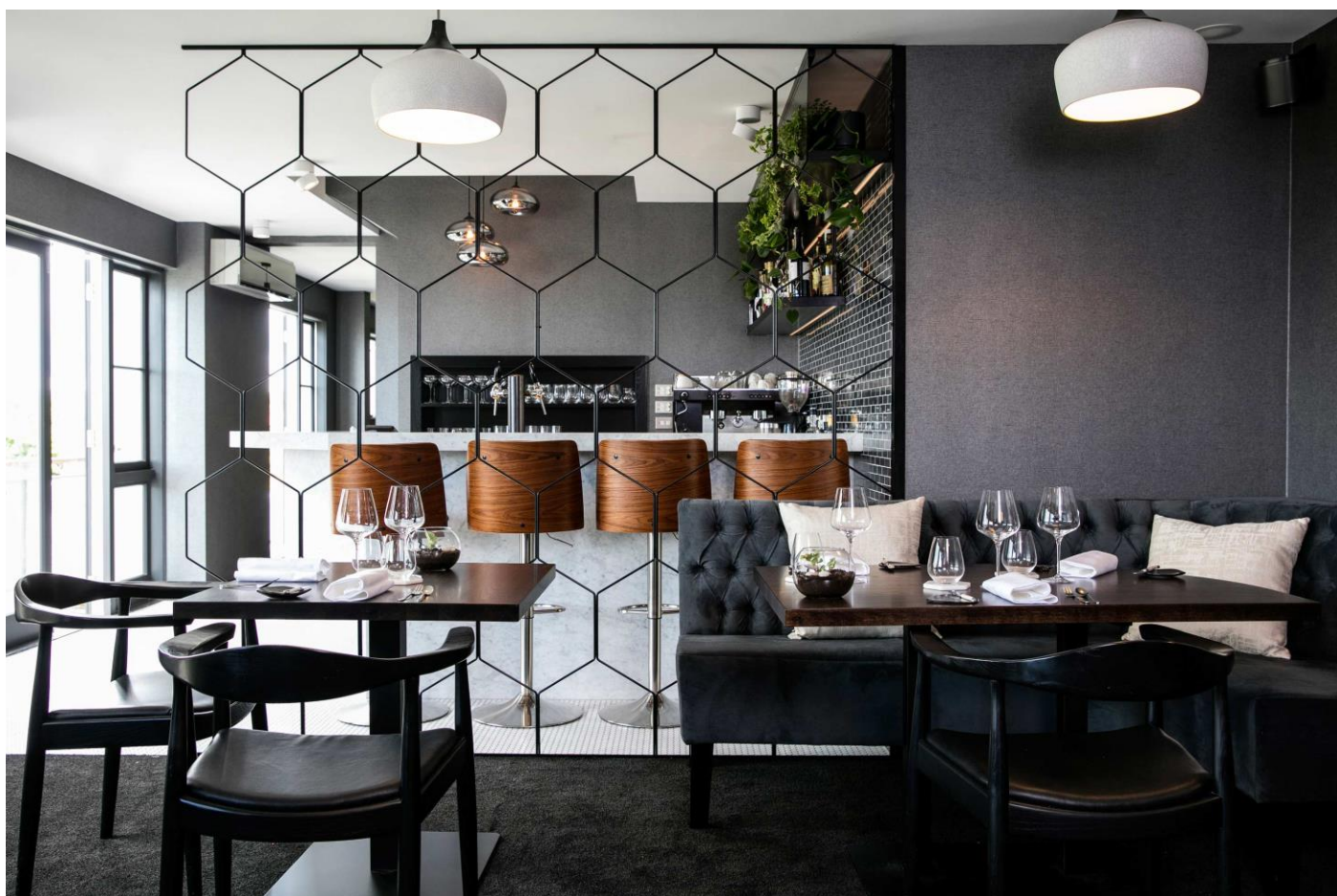
Sidart – Auckland